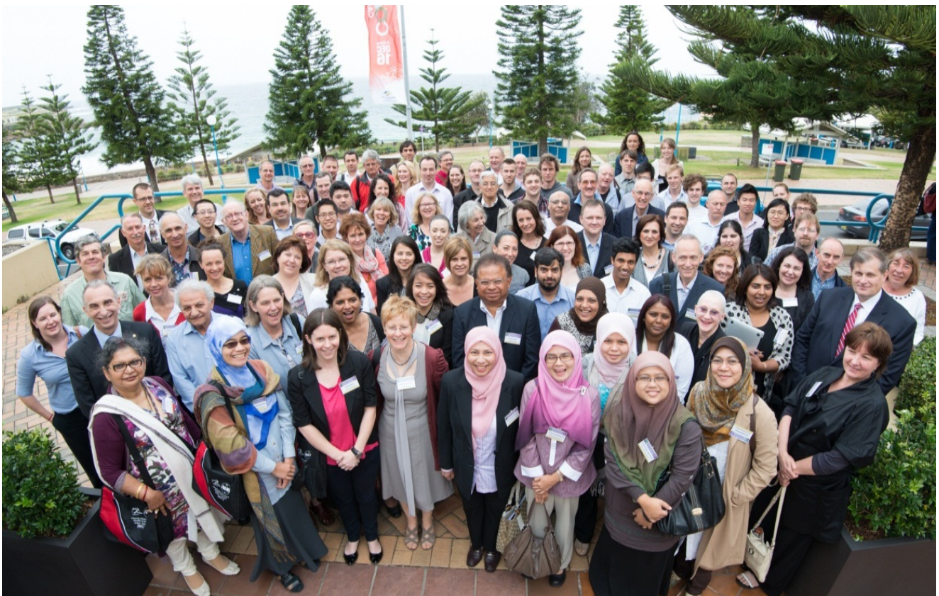
Group photo of the ANZACA 2012 conference delegates

See the ANZACA website for further details – http://anzaca.otago.ac.nz